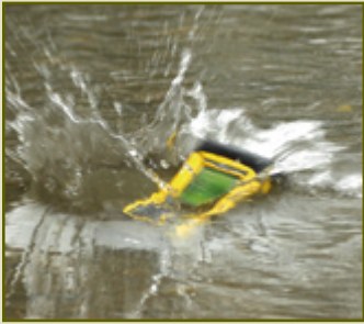
RUGGED AND WATERPROOF