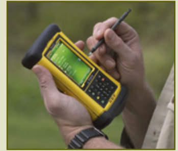
SUNLIGHT READABLE VGA DISPLAY