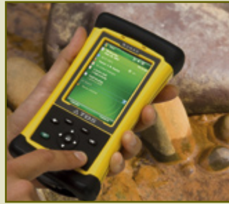
WINDOWS MOBILE 6